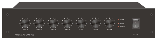
AA mixer amplifier

Public Address mixer and slave amplifiers